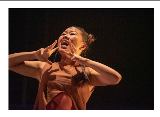
DASTAK: I WISH YOU ME ANANYA DANCE THEATRE